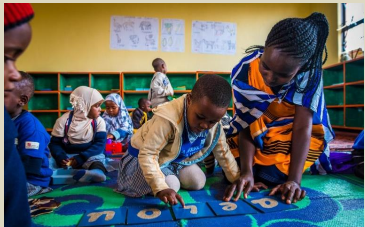
Photo 3: NAFGEM Kindergarten teacher being close to the girls for support

a) Daycare/Kindergarten: Three (3) classrooms are built and accommodated children aged 7 and below. The project which is funded by Mundo Cooperante – Spain provides the opportunity for children to socialize, play and learn the basics in reading, writing and counting. NAFGEM is using day care/kindergarten to pull in children especially girls who would have been without protection against FGM and child marriage. Two (2) teachers with Montessori skills have been hired to provide teaching and care to the children at the center.