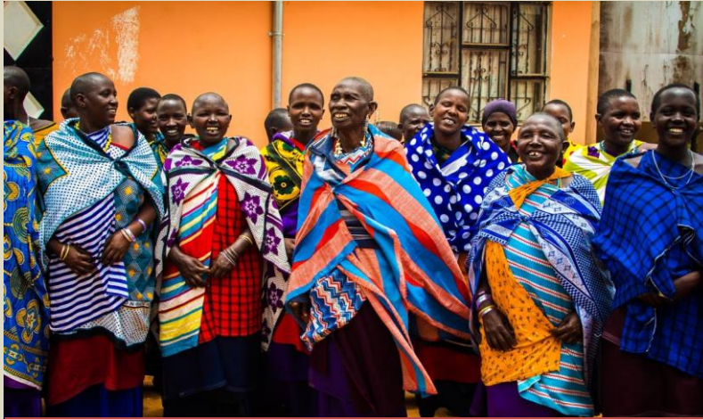
Photo 6: Brighter faces of women group members who stood up to campaign against FGM in Simanjiro