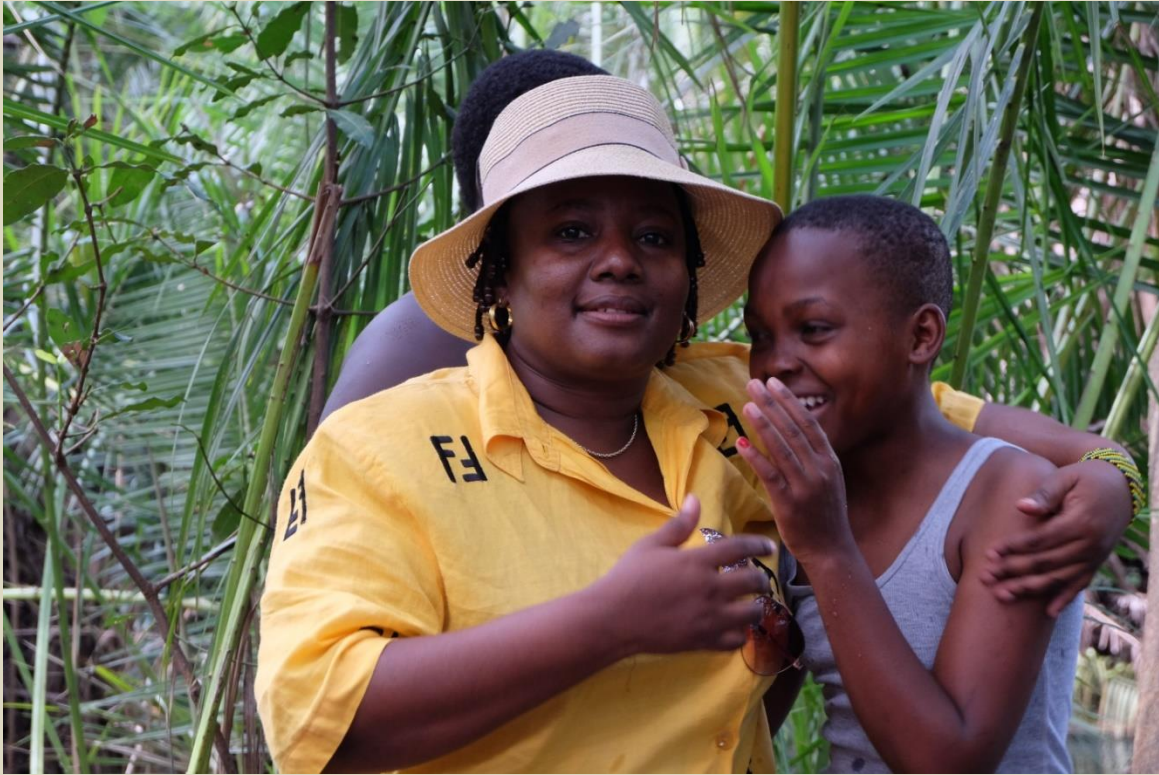
At NAFGEM safe shelter – girls who would have been married are happy and safe