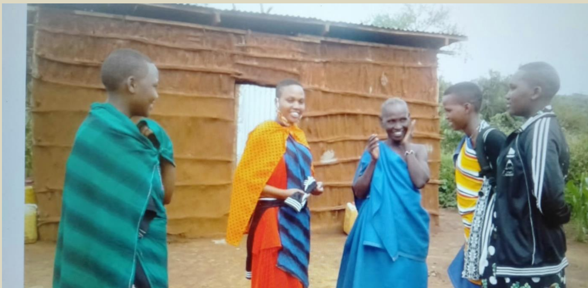
Re-integration of girls in their families – a joyful events facilitated by NAFGEM staff