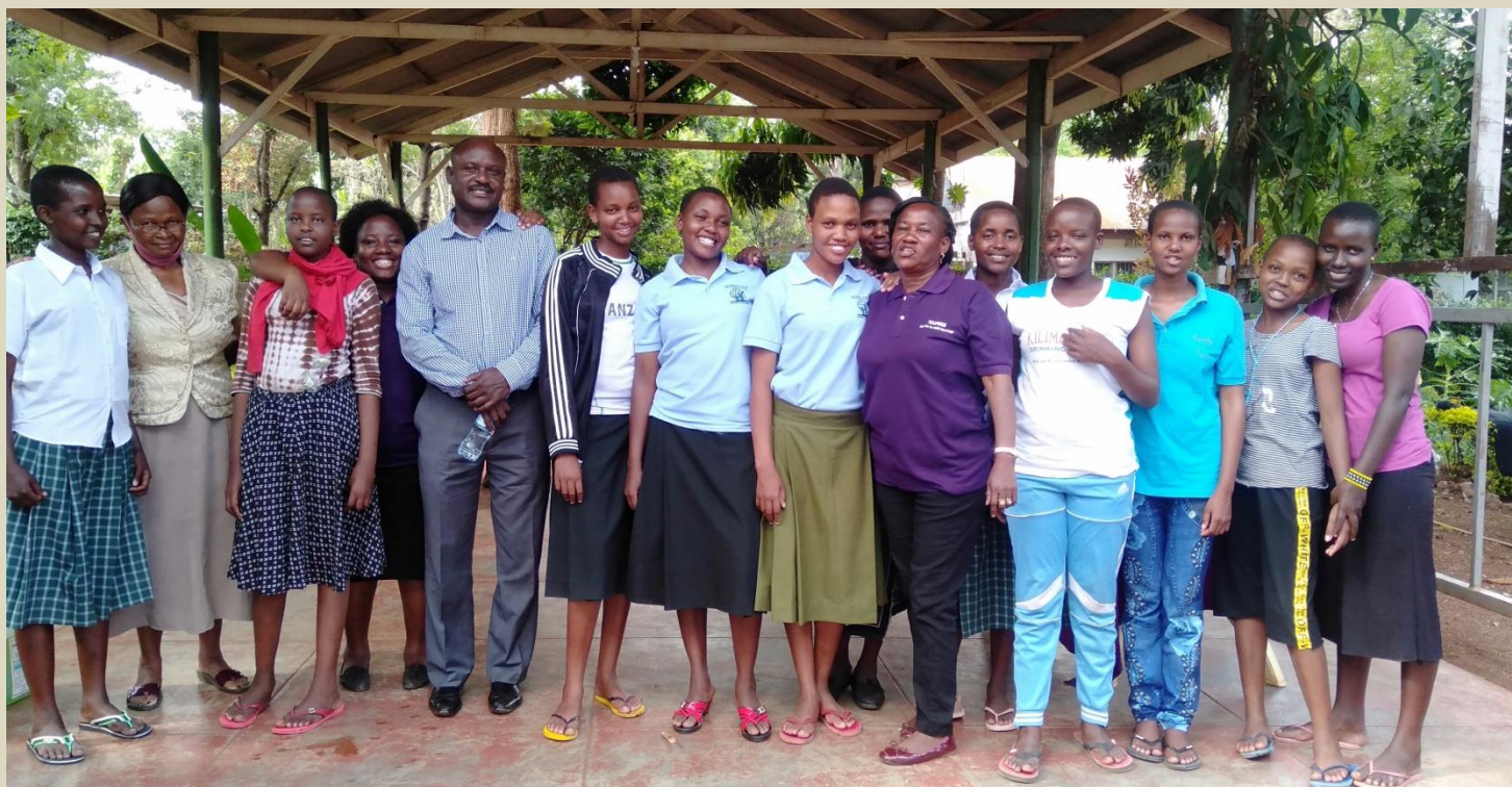
Photo 1: Girls under NAFGEM support with Executive Committee members