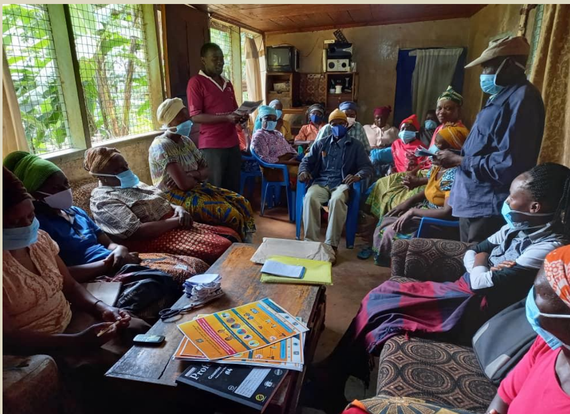
WORTH Yetu Group member educating fellow members on COVID- 19 protection – funded by USAID/NPI-Expand/Palladium