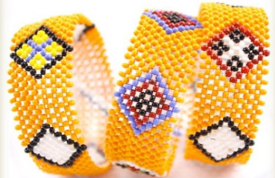
Alternative means of income to the would have been female genital cutters

Maasai women are excellent in beads handcrafts which is supported they can generate income for self sustainability and avoid male dependency. Their groups are made up of ex-female genital cutters, influential women and the ordinary ones who team up to campaign for their rights and the end to FGM and child marriage. Compliments to Mundo Cooperante and Friends.