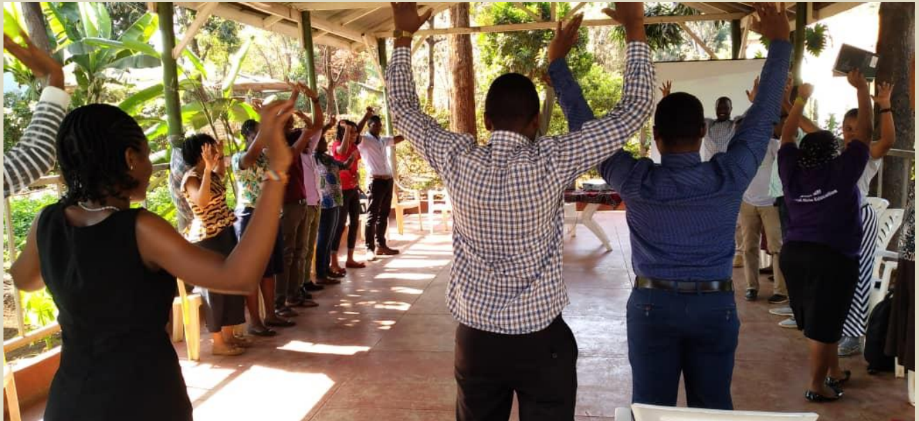
Girls at Moshi NAFGEM safe shelter strategizing together during school holiday