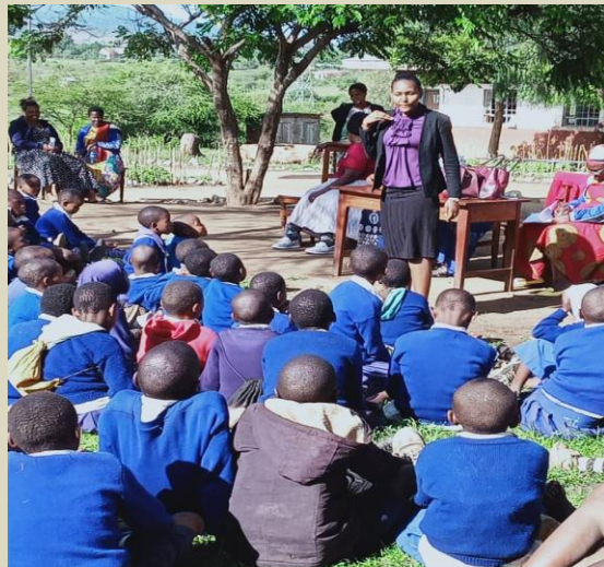
Photo 2: Field Officer Training Child club members in Hanang/Manyara

Activities under this project were implemented in Kiteto and Hanang districts with fundings from BMZ/Materra, a three years project which started in 2018 in 10 wards. Under the National Plan of Action to end Violence Against Women and Children (NPA-VAWC) guidance 13 protection committees were formed and trained being 1 at regional level, 2 districts and 10 at ward levels. Members trained were 311 (181M,130F) from mentioned sites and as defined in the NPA-VAWC. In their trainings emphasis was put on women, children and youths protection; human rights and their roles and responsibilities to ensure incidents of abuse against women, children and youths are eliminated in their communities.